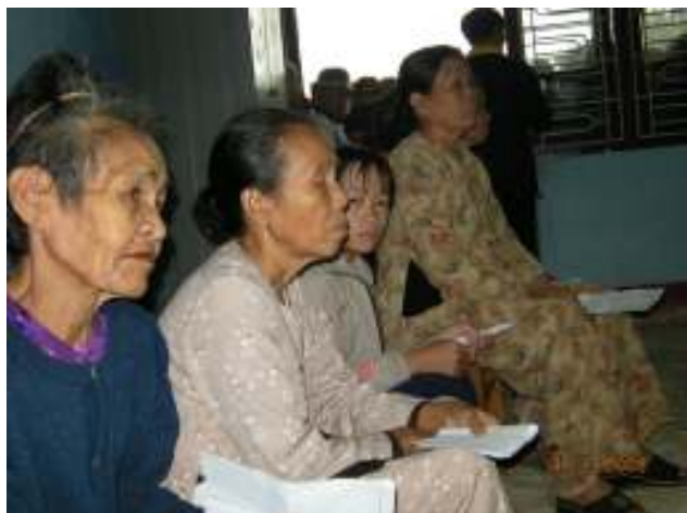
Above: Local officer calling patients to see the doctor

By 8:30am the medical examination began. All patients were provided with a medical ticket in advance to go to see a doctor under the management of local officers and Hue Help's staff. Then they were with medicine on prescription at the free pharmacy after finishing their medical examination.