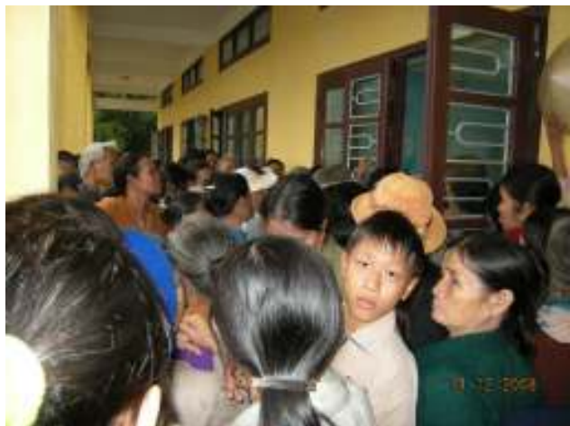
Above: the people waiting outside of the consultants room