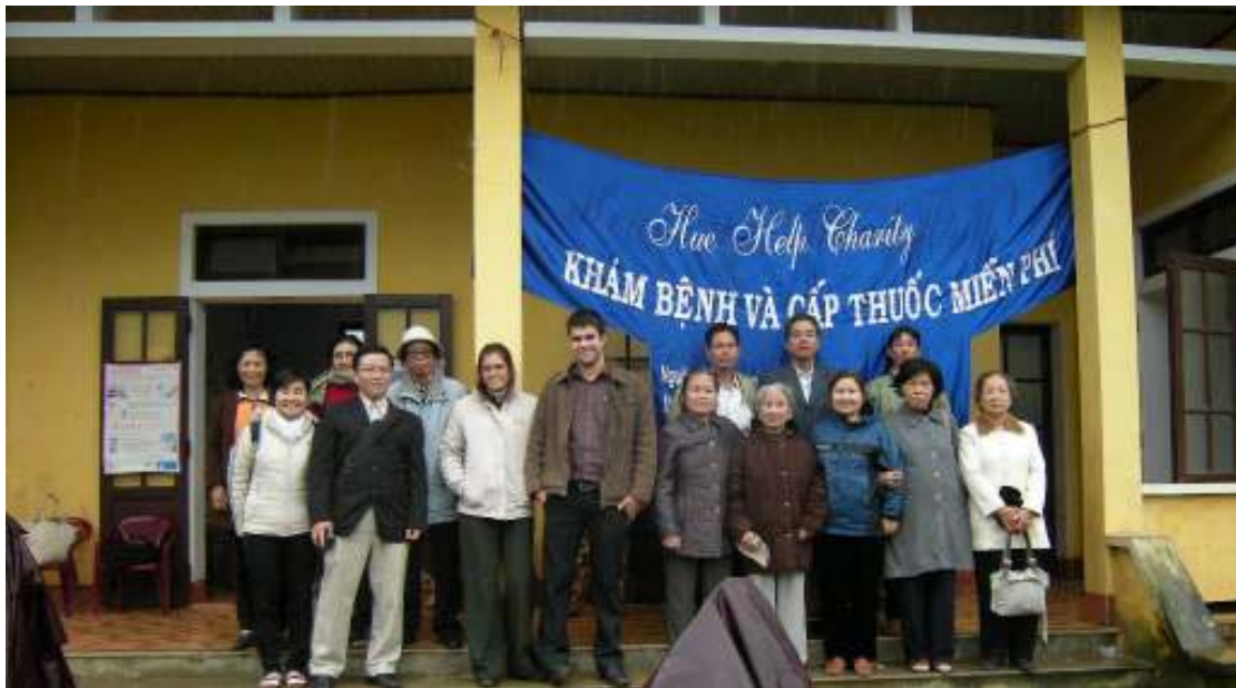
Above: Medical team and local authorities

With Thua Thien Hue People Committee's consent, Hue Help has collaborated with Phu Loc's Red-Cross and Loc Bon's People Committee to carry out the program. Phu Loc's Red-Cross and Loc Bon's People Committee would be responsible for identifying and delivering medical tickets in advance for 300 needy people in the villages; sending officers to organise the program. Hue Help would send one medical team comprising 6 doctors who have specialties of general practitioners, podiatrists, physicians and cardiologists and one pharmacist and the volunteers from Hue Medical University, together with the medicines in many varieties. The medical team of Hue Help would be responsible for the medical specialty during the process of the medical examination.