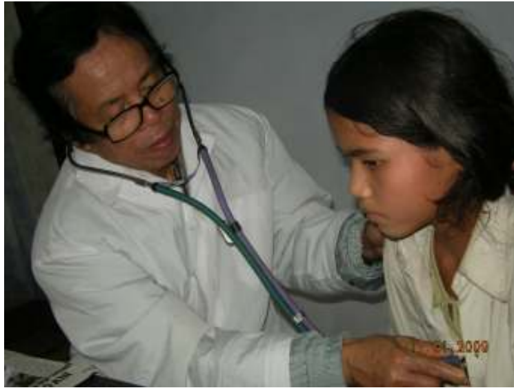
Above: Dr Lap checking health for a child