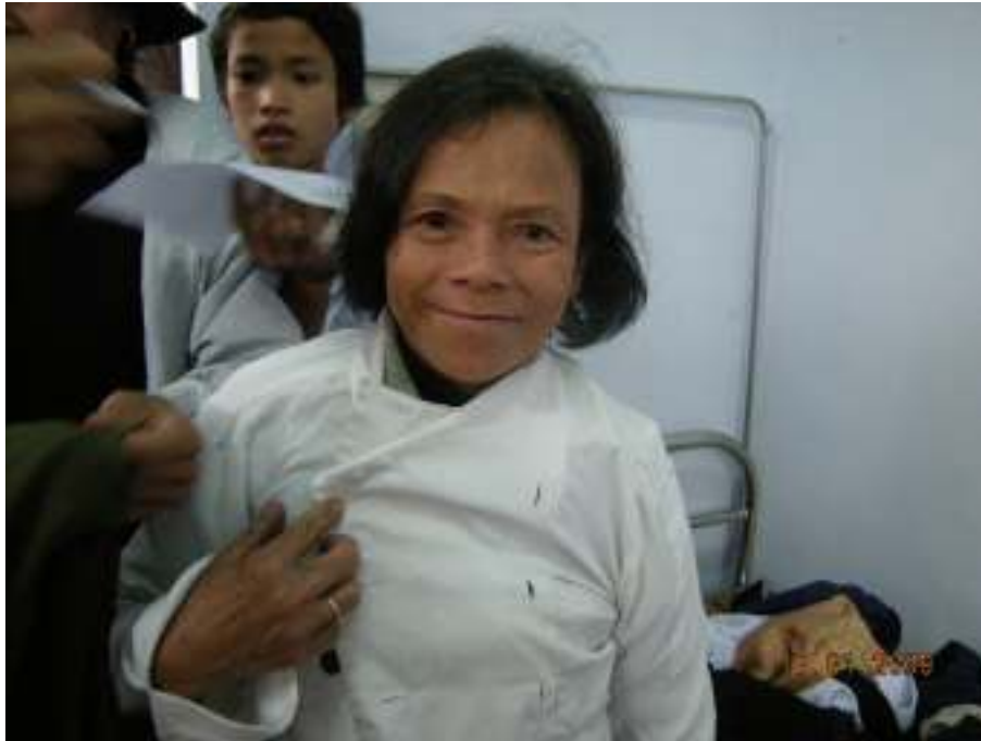
Above: A farmer is glad to receive the clothes