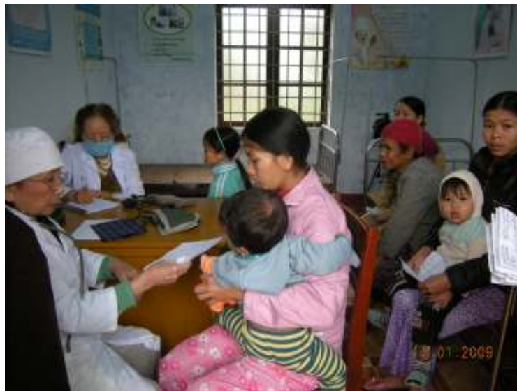
Above: inside of one consultant room

By 8:30am the medical examination began: every patient was provided a medical ticket in advance to go to see a doctor under the management of local officers and Hue Help's staffs. Then they were provided medicine free at the pharmacy after finishing their medical examination.